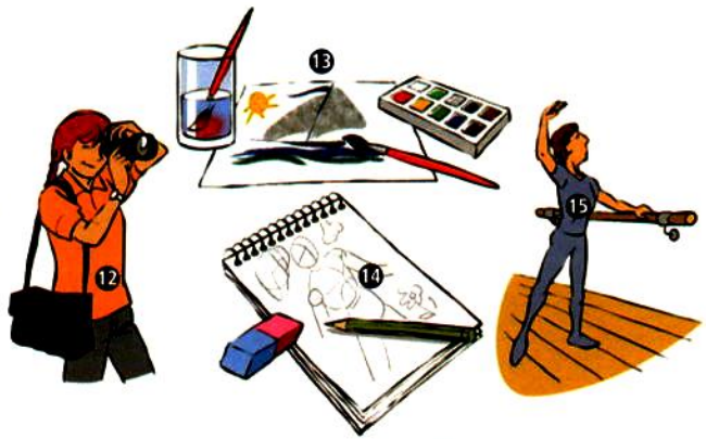
Are you artistic?