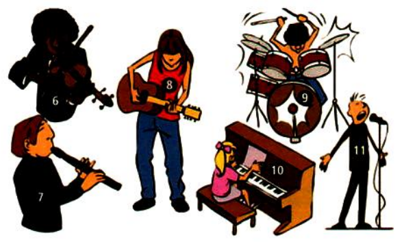
Are you musical?