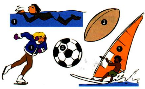
Are you sporty?