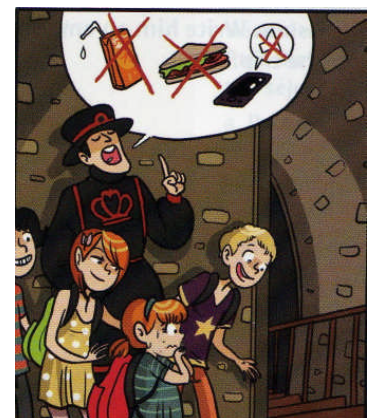
At the Tower of London